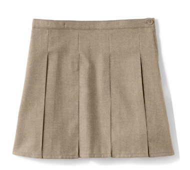
Girls Solid Box Pleat Skirt Top of Knee, Khaki