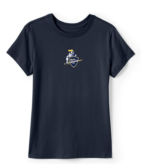
Short or Long Sleeve Essential & Performance Tees