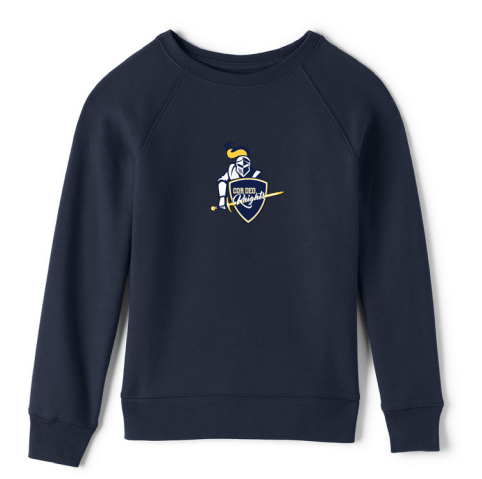
Crew Sweatshirt (May be worn over collared shirt during school in cold weather)

Available to students, staff, and parents for weekend and special event wear. Available through Lands' End.