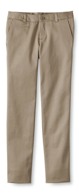
Girls Chino Pants, Khaki