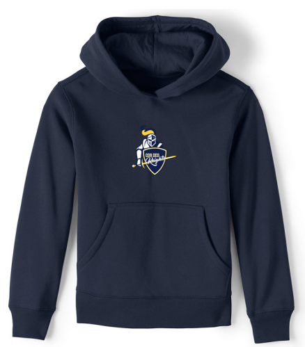
Hoodie Pullover Sweatshirt (May be worn over collared shirt during school in cold weather)