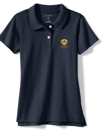
Polo Shirt, Short or Long Sleeve, Navy (logo required)