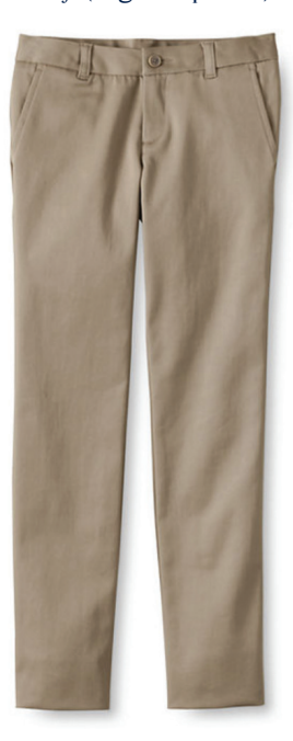
Girls Chino Pants, Shorts, or Skort, Khaki