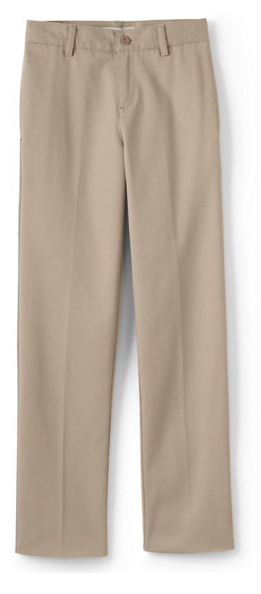
Boys Plain Front Tailored Chino, Khaki