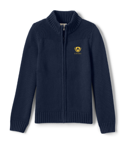
Boys Performance Zip-Front Cardigan, Navy