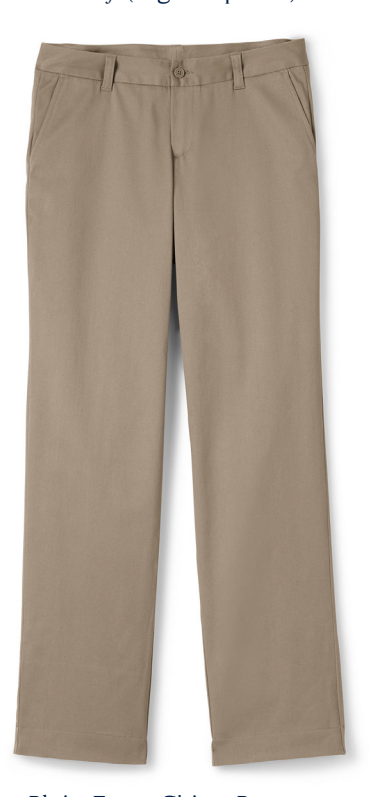
Plain Front Chino Pants or Shorts, Khaki