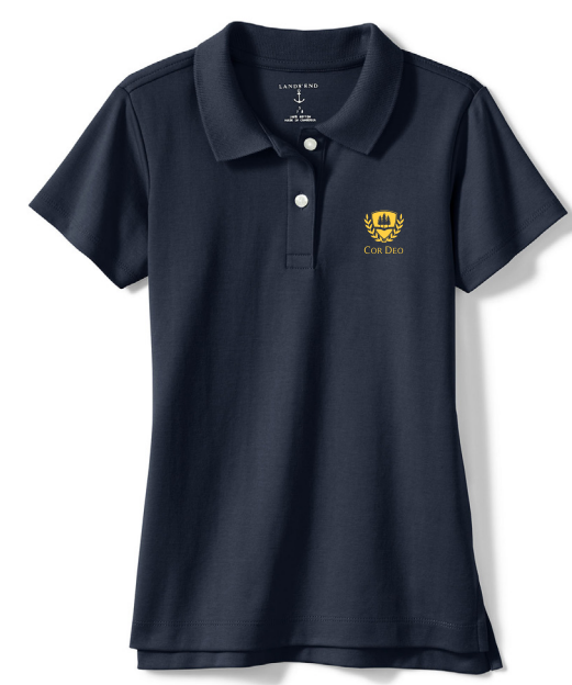
Polo Shirt, Short or Long Sleeve, Navy (logo required)