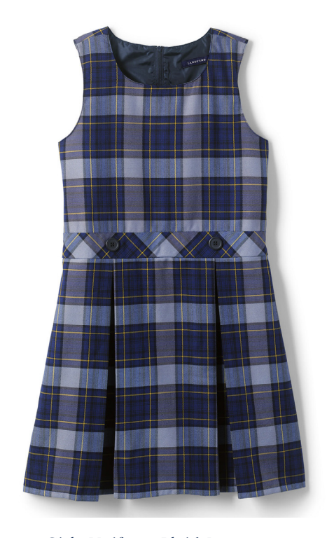
Girls Uniform Plaid Jumper, Classic Navy Plaid