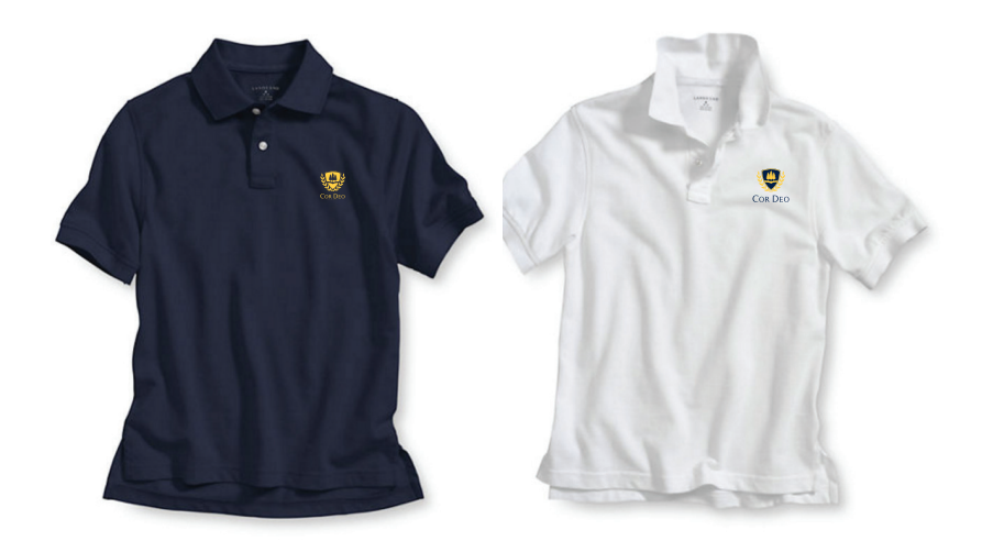
Polo Shirts, Short or Long Sleeve, Navy or White (logo preferred but not required)