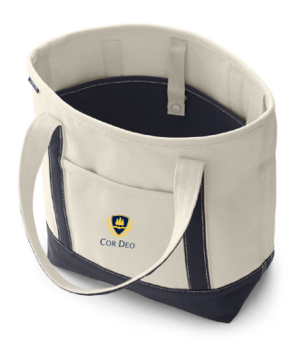
Open Top Canvas Tote, Navy (logo optional)