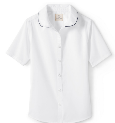
Girls Short Sleeve Piped Collar Shirt

Girls Solid Box Pleat Skirt Top of Knee, Khaki