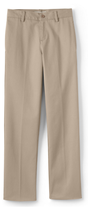
Boys Plain Front Chino Pants or Shorts, Khaki

Field trip uniforms may be used for everyday wear but must be worn on active or outdoor field trips. Teachers will communicate whether dress or active field trip uniform is to be worn.