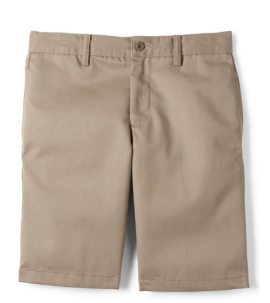
Boys Plain Front Chino Shorts, Khaki