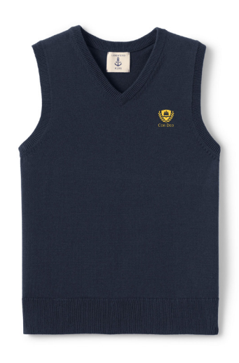
Boys Performance Fine Gauge V-Neck Vest (required for c oncerts & field trips) or Sweater (in cold weather), Navy (logo required)