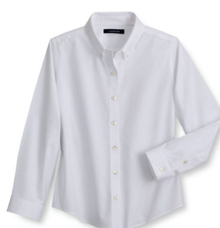
Girls Long Sleeve Blouse, White