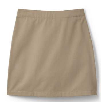
Girls Plain Front Skort, Khaki