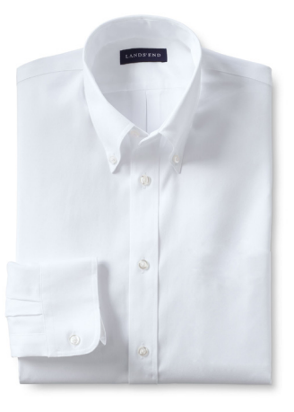
Boys Long or Short Sleeve No Iron Pinpoint, White