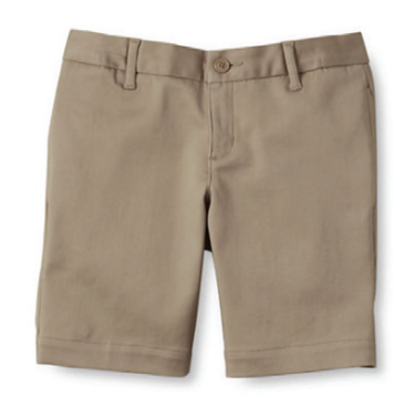
Girls Chino Plain Front Shorts, Khaki