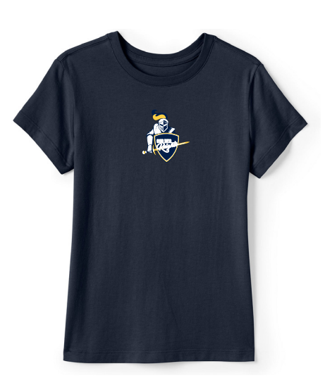
Short or Long Sleeve Essential & Performance Tees