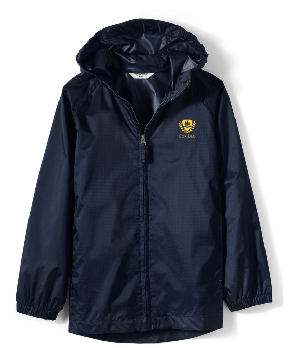
School Uniform Packable Rain Jacket, Navy (logo optional, fleece lined option also available)