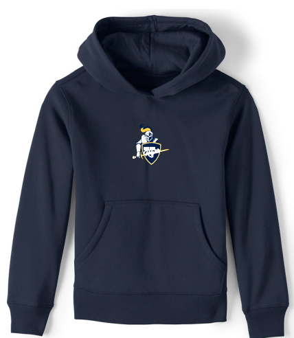
Hoodie Pullover Sweatshirt