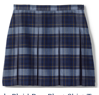
Girls Plaid Box Pleat Skirt Top of Knee, Classic Navy Plaid