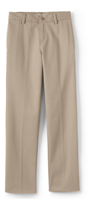
Boys Plain Front Chino, Khaki