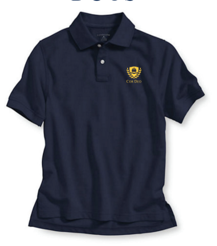
Polo Shirt, Short or Long Sleeve, Navy (logo required)