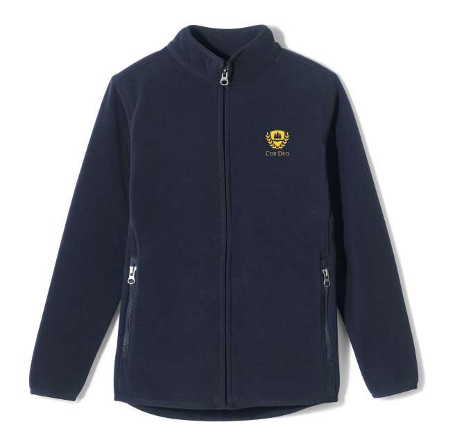
Fleece Jacket, Navy (logo required)