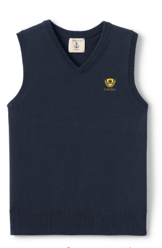
Boys Performance Fine Gauge V-Neck Vest, Navy