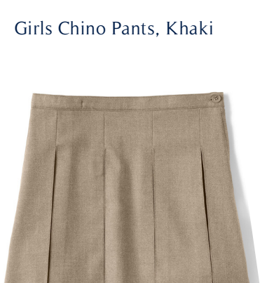
Girls Solid Box Pleat Skirt Top of Knee, Khaki