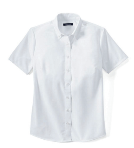
Girls Short Sleeve Blouse, White