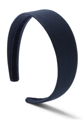
Girls School Uniform Headband, Navy or Classic Navy Plaid