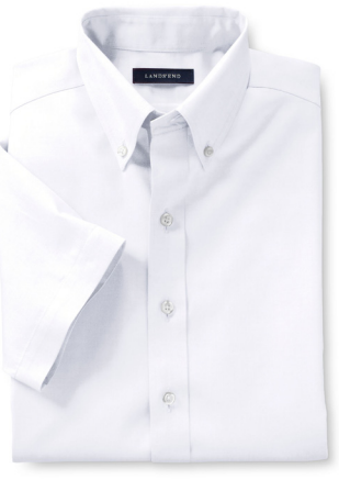
Boys Short Sleeve No Iron Pinpoint, White