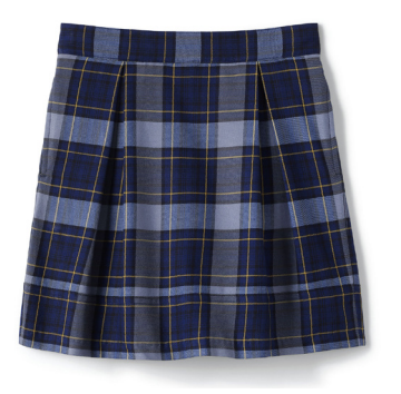
Girls Plaid Pleated Skort Top of Knee, Classic Navy Plaid